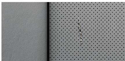
Tears equal to or less than 1/2"