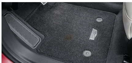
Removable stains and minor carpet wear