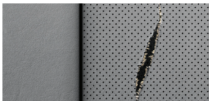
Tears more than 1/2"