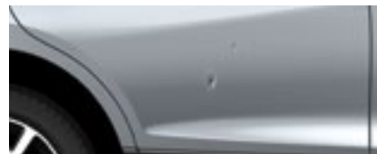
4 or more dings per panel or multiple dings equal to or greater than 2" per panel