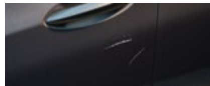
1 dent (greater than 4") or 1 scratch (equal to or greater than 6") per panel