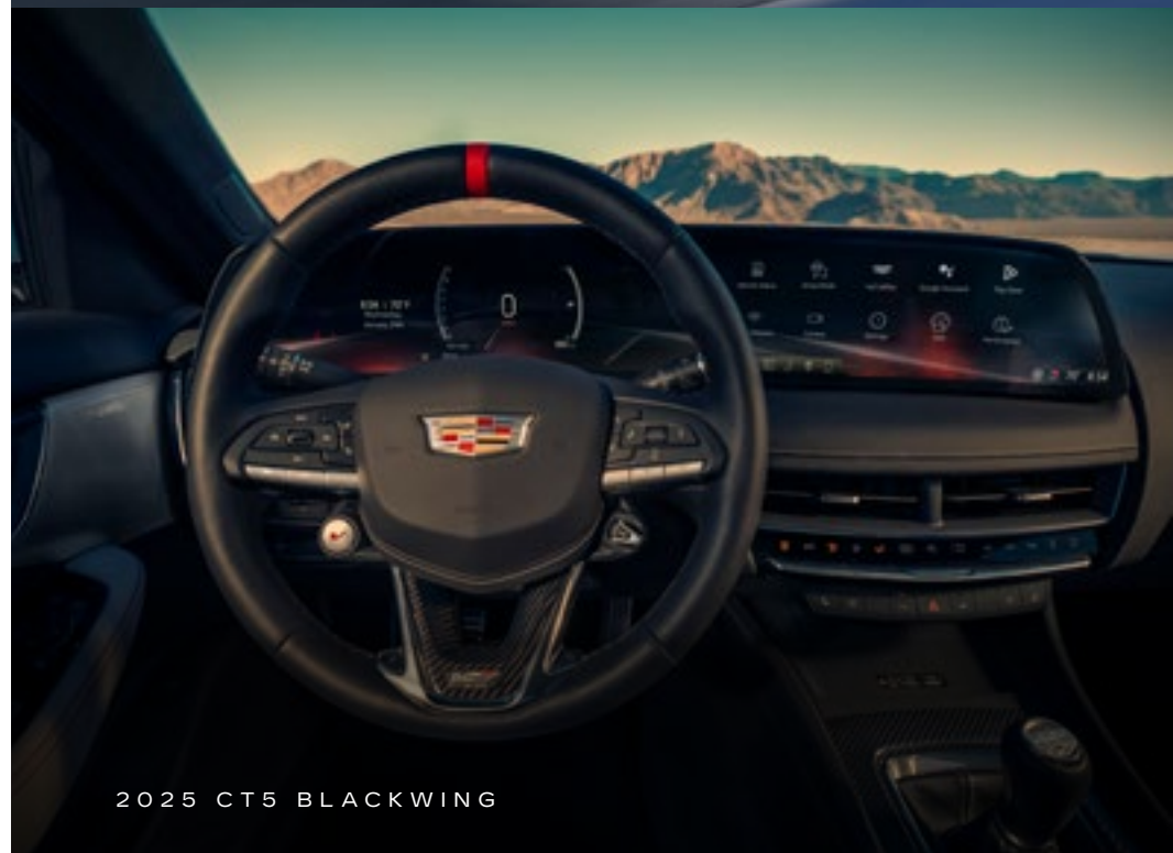
2025 CT5 BLACKWING