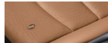
Upholstery holes greater than 1/8"