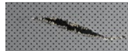
Tears equal to or greater than 1/2"