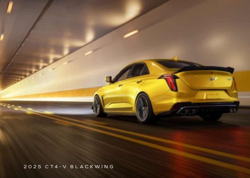
2025 CT4-V BLACKWING