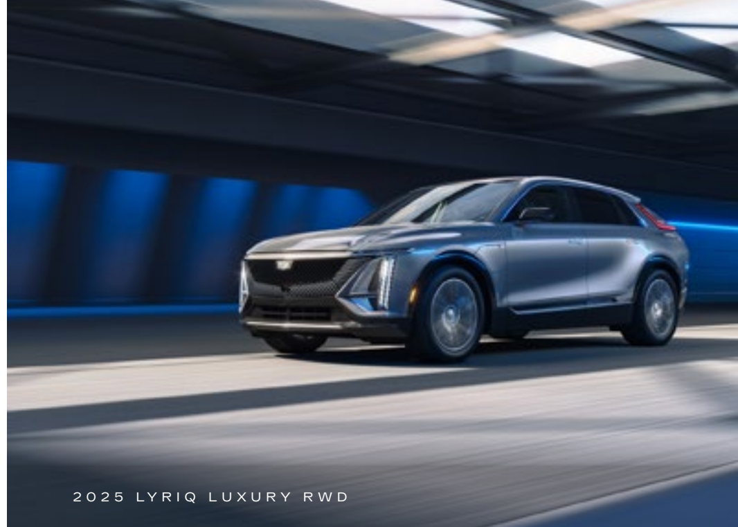
2025 LYRIQ LUXURY RWD

1 If you buy or lease a new GM vehicle, your disposition fee of up to $595 may be waived. See Section 4 of your lease agreement for details.